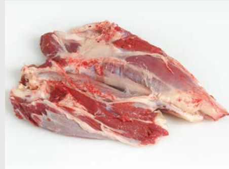
1. Position of the boneless fore shin.